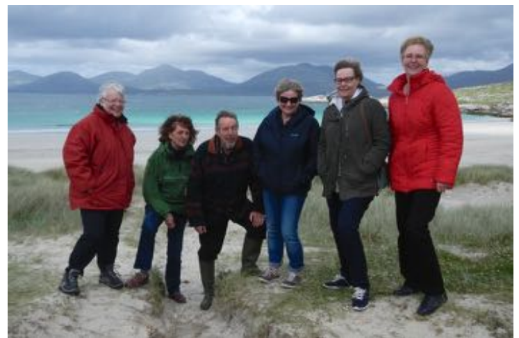
Some of last year's Gaelic students enjoying the island

So why not think about joining us on a Gaelic course? Think of it - even the ever-present topic of the weather could become a whole new world to explore, if you embrace it in Gaelic. 'Tha I robach an diugh' won't have you thinking that there's been a burglary locally, and you'll be able to confidently reply, most likely in the affirmative while hanging on to your hat, 'S i a tha!'